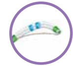
Pre-Cut-Type with Tapered Tip