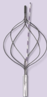
6 wires dormia type