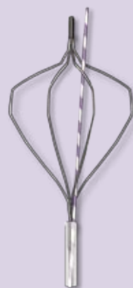
4 wires basket type